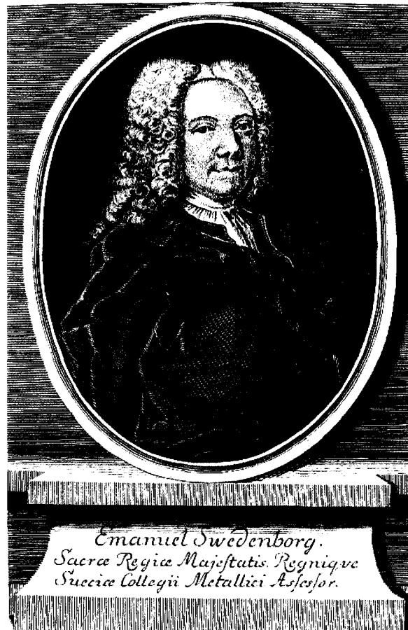
24. Emmanuel Swedenborg (Swedish scientist and mystic, 1688—1772). His writings, in which he claimed that the ancient teaching existed in Great Tartary (Tibet?), also influenced Helena Blavatsky.

It seems strange to you that a Hindu Sahib comes like an intruder ... into my house [body] ... When his double, or the real Sahib leaves temporarily his vehicle, the body is left in a similar state to that we can observe in a calm idiot. He orders it either to sleep or it is guarded by his men. At first it seemed to me that he pushed me out of my body, but soon I seemed to become accustomed to it, and now during the moments of his presence in me, it only seems (to me) that I am living a double life. I am learning only now to leave my body; to do it alone I am afraid, but with him I am afraid of nothing. 33