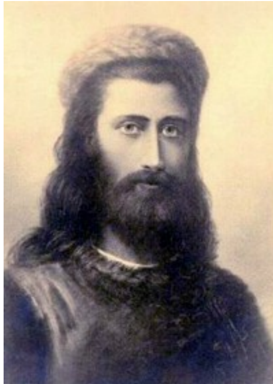
17. Master Koot Hoomi Lal Singh, who was said to have been Pythagoras in a previous incarnation and to have lived in Shigatse during Helena Blavatsky 's lifetime. Many of the mysterious letters that Helena Blavatsky and other Theosophists received by miraculous means are supposed to originate from him.

called Morya, was a member of an Indian or Nepalese delegation that stayed for some time in London. When she met him, 'a tall Hindu', in London—or according to another version, in Ramsgate—she immediately recognized in him the person who had often appeared to her 'in the Astral', that is to say, in her astral, non-corporeal form. The very next day she met him again in Hyde Park. In the course of this he is supposed to have disclosed to her that he had come to London on an important mission with some Indian princes and wanted to meet her personally, because he needed her co-operation for a task he wished to tackle. He told her at this meeting how the Theosophical Society was to be formed and that he wished HPB to found the Society. Morya also asked her to travel to Tibet and live there for three years, to prepare herself for her important task. 2