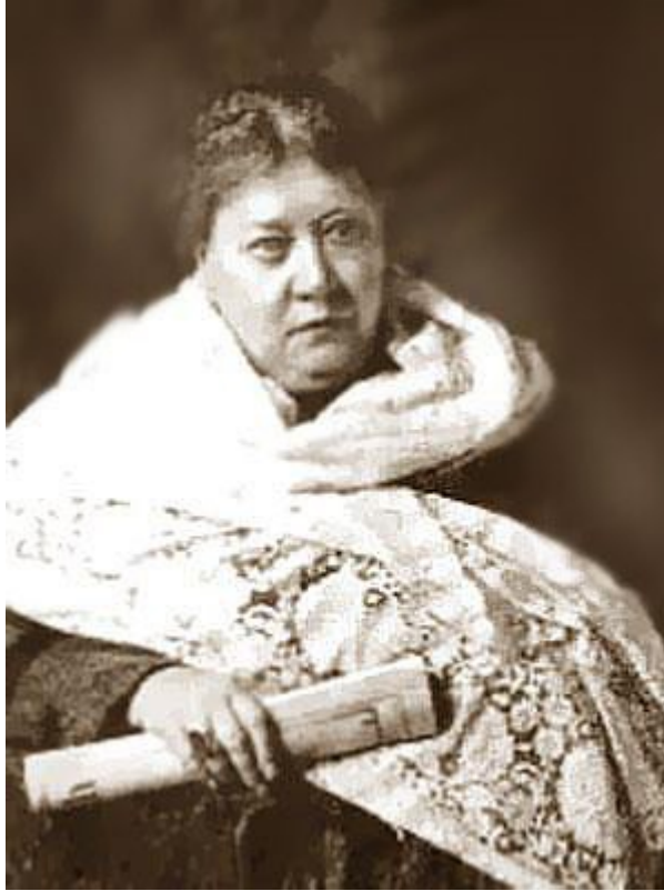
19. Helena Petrovna Blavatsky (1831-1891), co-founder of Theosophy, described herself as a 'Thibetan Buddhist', who had already as a child been quite familiar with the 'Lamaism of the Tibetan Buddhists'. She was regarded as a chosen one, who was supposed to carry the secret knowledge of the sages living the other side of the Himalaya in Tibet to Europe and the USA. She was called by her admirers 'the white yogini of the West', 'a messenger of the light' or 'the most remarkable woman of our century'.